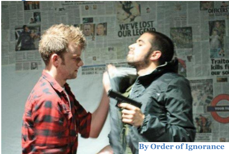
By Order of Ignorance

When Sell a Door Theatre Company decided to take no less than four shows to the Edinburgh Fringe Festival there were worries that the LIPA graduates and students involved had over-reached themselves.